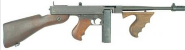
Thompson Model 1928A1 submachine gun, wartime production (simple, non-adjustable and non-protected rear sight and plain barrel).