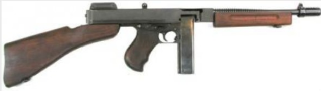
Thompson Model 1928A1 submachine gun with 20-round box magazine and Cutts compensator.