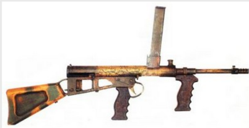
Owen Mk.1-43 submachine gun in camouflage paint